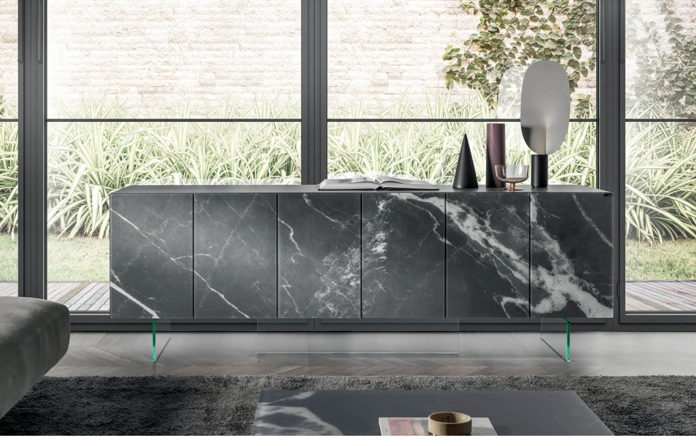
FURNITURE INCREASINGLY ESSENTIAL IN STYLE